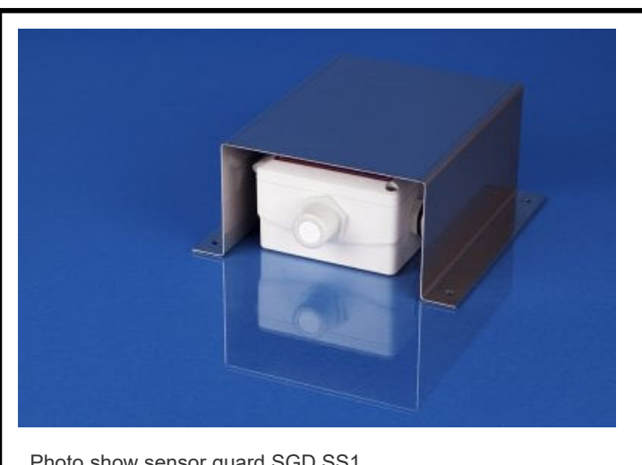
Photo show sensor guard SGD SS1 together with VCP carbon monoxide gas detector.

Sensor guard designed to protect different kind of room/wall sensors from damage