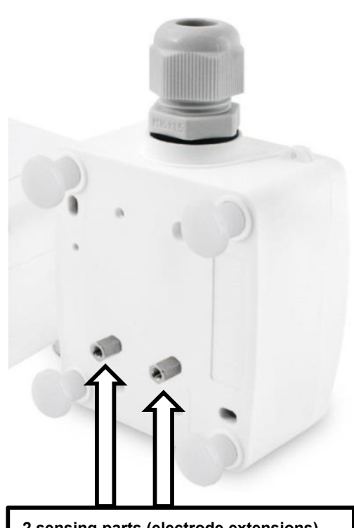
2 sensing parts (electrode extensions) under the WLD 24 unit for detection of water and moisture