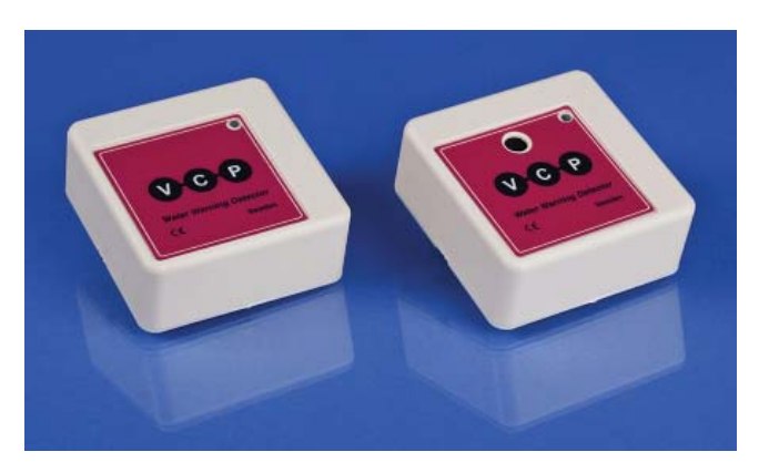
WWD 102N without buzzer